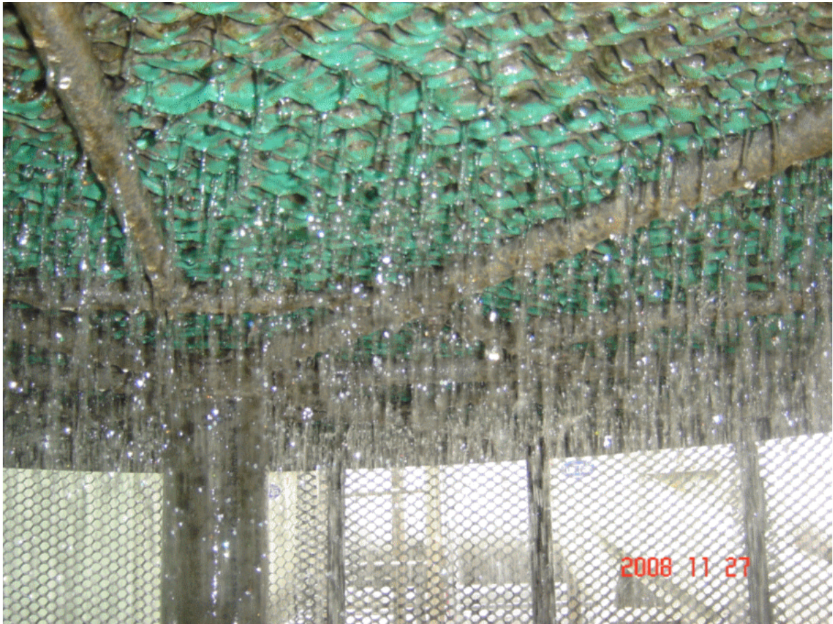
11/27 ten weeks later, the radiator was more clean.