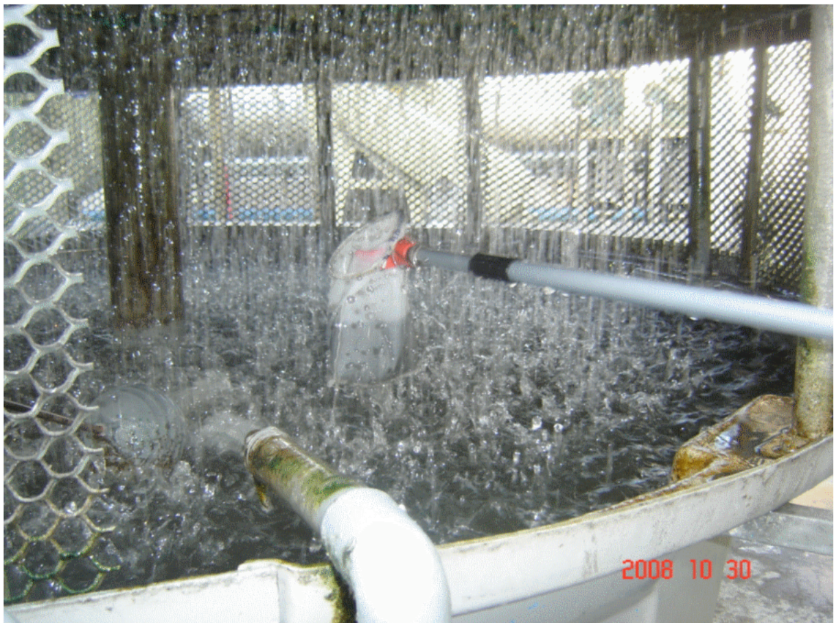
10/30 six weeks later, you could net a hug amount of scale in the plate.