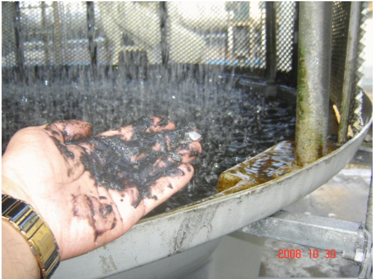
10/30 six weeks later, netted the scale from the plate of mud and flake.