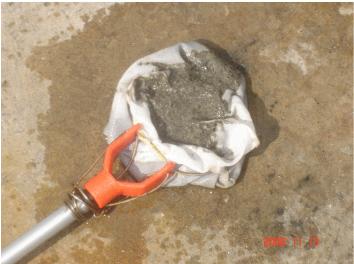
11/13 eight weeks later, a hug amount of scale fell to the plate.